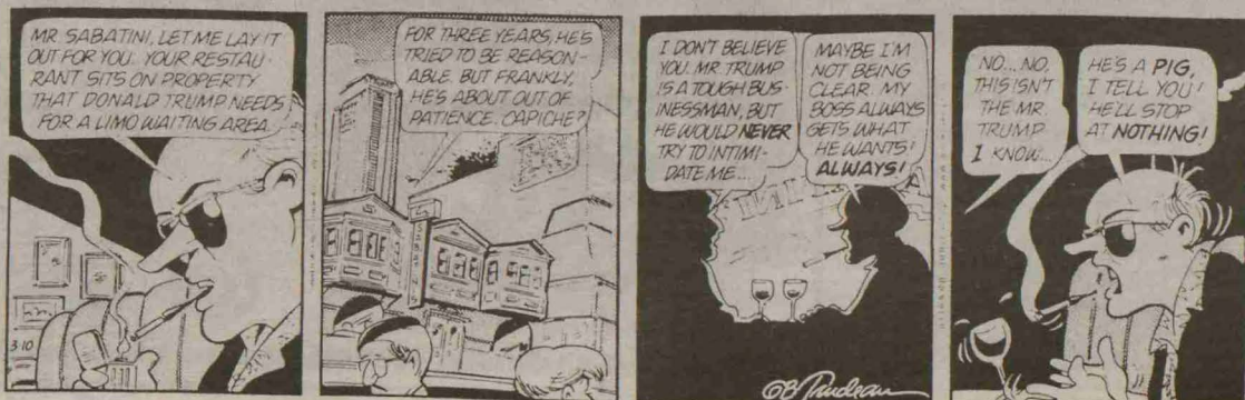
BY GARRY TRUDEAU