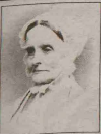
LUCRETIA COFFIN MOTT

If only one ticket has all of the elements to be the best representative of WSU students, we at The Daily Evergreen believe it is the Chin/Musella ticket.