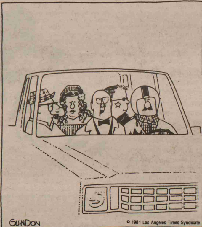
"I'm changing car pools."