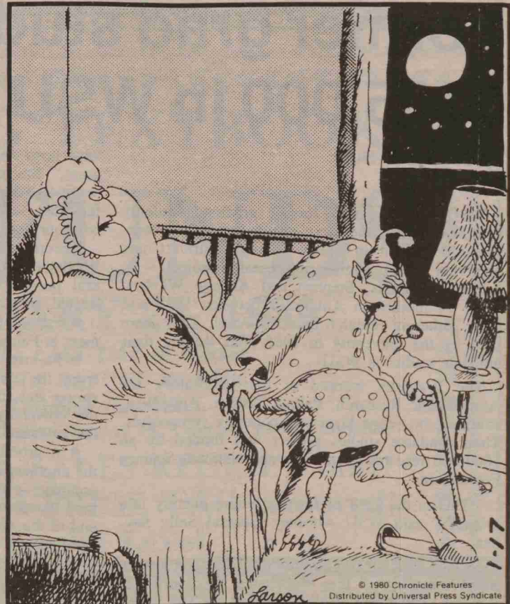
"Well, I just think I've been putting up with this silly curse of yours long enough!"