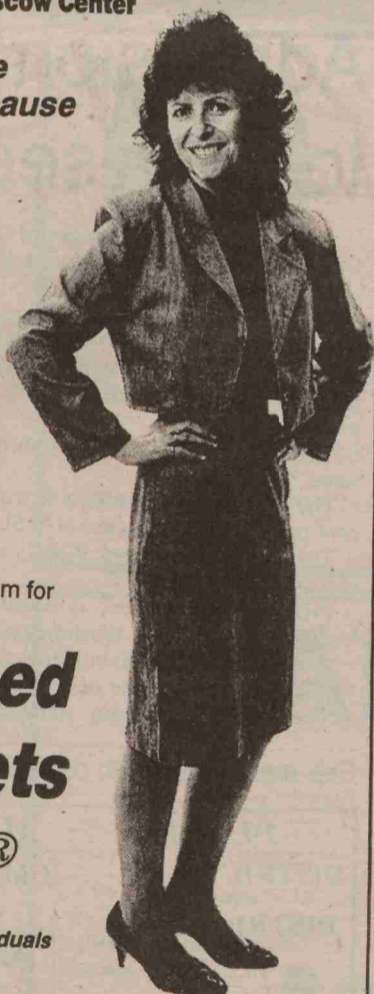
©1989, Nutri/System, Inc.

As people vary, so does an individual's weight loss.