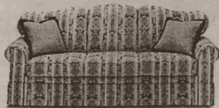
All Flexsteel Furniture