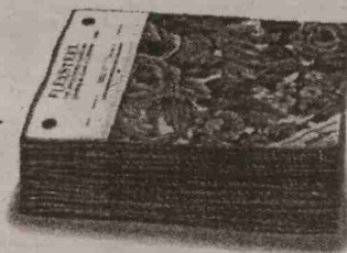
Over 1,000 Fabrics and Leathers